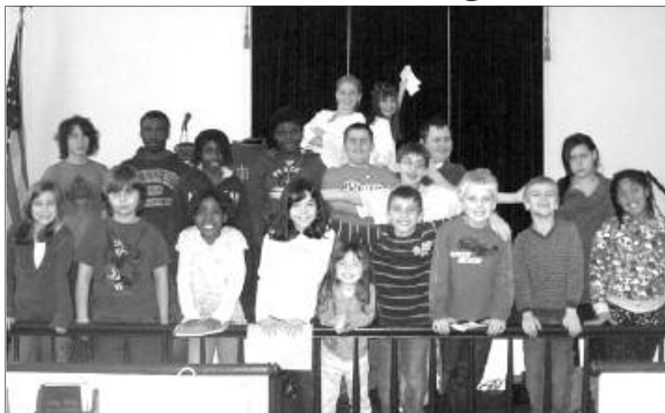
The Sugar Loaf United Methodist Church Sunday School production of “Once Upon a Christmas Cheery...A Night to Remember” was held on Dec. 13. A pot trust luncheon followed the Christmas pageant. (Photo provided)