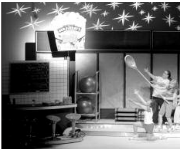
"Food Fight" will be at the Lycian Center on Sat., Feb. 6.

"Food Fight: A Musical Comedy for Waist Watchers!" the hilarious hit show about the love/hate relationship with food, dieting and exercise, is coming to the Lycian Centre for the Performing Arts in Sugar Loaf on Sat., Feb. 6 at 8 p.m.