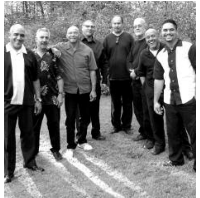
The eight-piece salsa band, "Cuboricua" will be appearing at Coquito Restaurant on Forester Avenue on Sat., Jan. 30 at 10 p.m. Call for reservations.